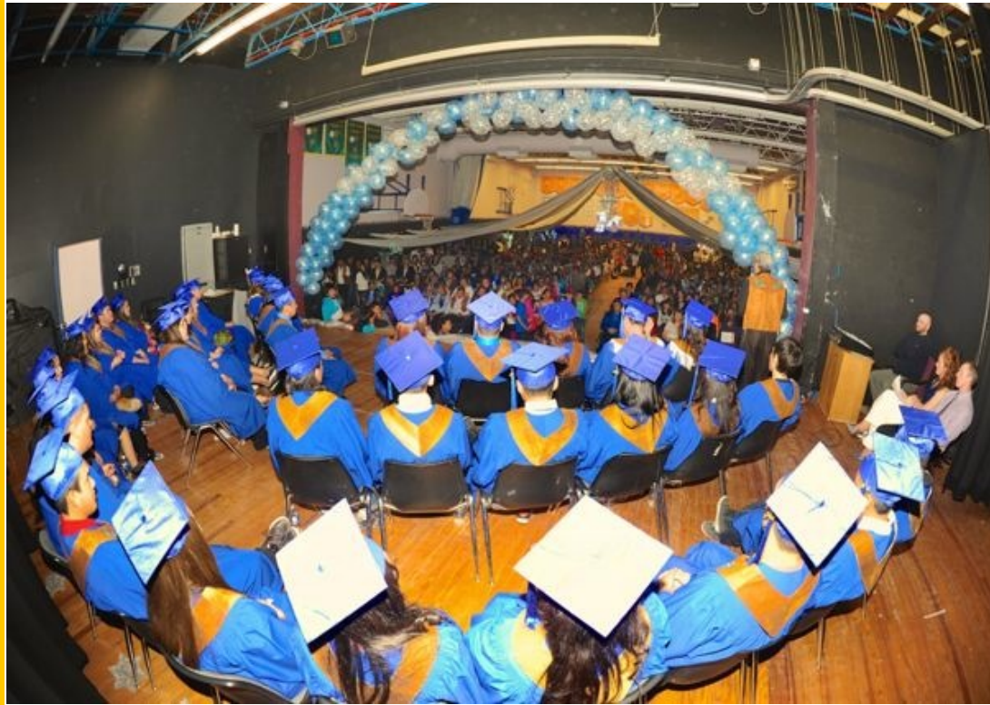
Grad Class 2014 (last year's grad class).